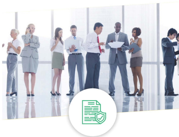
Drug Testing Policy Development and Review